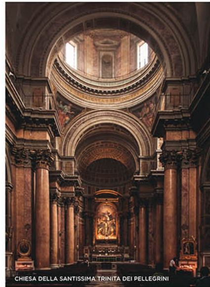
CHIESA DELLA SANTISSIMA TRINITÀ DEI PELLEGRINI

Holy Deer’s pièce de résistance is the Pope’s room, which served as the backdrop to Innocent X’s love affair with his rumoured mistress Donna Olympia. This gloriously atmospheric, high-ceilinged bedroom is the most ornate of all. I can’t actually bring myself to waste a minute asleep, armed instead with plenty of distractions from a mosaic plunge pool to a secret chocolate drawer to a collection of brilliant books on the mistresses of the Vatican. However all I really want to do is look up and stare at the heavenly fresco of Dido, Queen of Carthage, and her lover Aeneas. In the morning I draw back the curtains and stand on the balcony overlooking Gian Lorenzo Bernini’s Fountain of the Four Rivers, watching young couples buying roses and bubble blowers, moving as though in slow motion to fit the rhythm of a place that both remains relevant and the very definition of “out of this world”. ▶▶