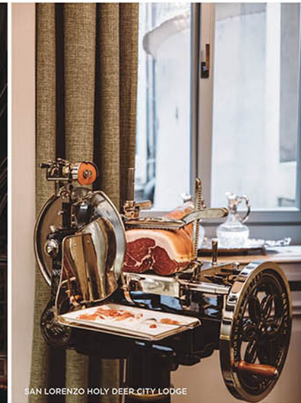
SAN LORENZO HOLY DEER CITY LODGE