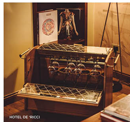
HOTEL DE 'RICCI

Head to this charming ice-cream store a short stroll away from the Piazza Navona to indulge in seasonal and floral flavours including lavender and white peach, mint stracciatella and white chocolate and basil.